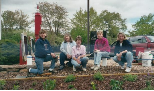
Planting Firefighters' Memorial Garden

2002 - Manchester Garden Club Committee helped create a red, white, and blue garden for the Manchester Firefighters' Memorial Garden in honor of the brave and selfless firefighters who died on September 11, 2001.