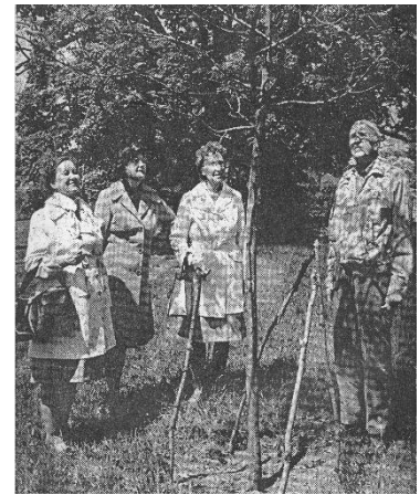
To commemorate the bicentennial, the club planted a 'Liberty Tree' at the Cheney Homestead, for which they received an award.

Charter Member of Manchester Land Trust and contribution made to Case Mountain Open Space Project