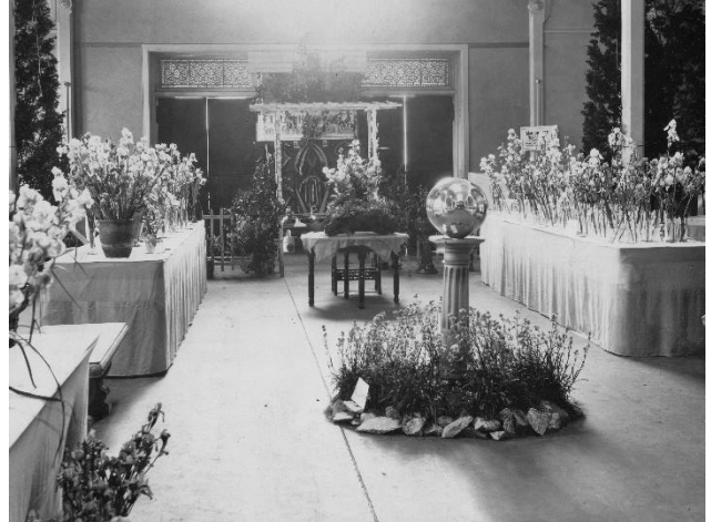
Club Flower show – June, 1928

Spring 1929 – Participated in CT Horticultural Society's June Flower Show, received Silver Medal