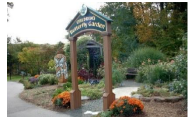
Children's Butterfly Garden

2003 - Creation of the Children's Butterfly Garden in Northwest Park. This garden was created as a direct result of this symposium. Our Club members created and, along with children from the community, help plant annuals every spring at this magical garden space.