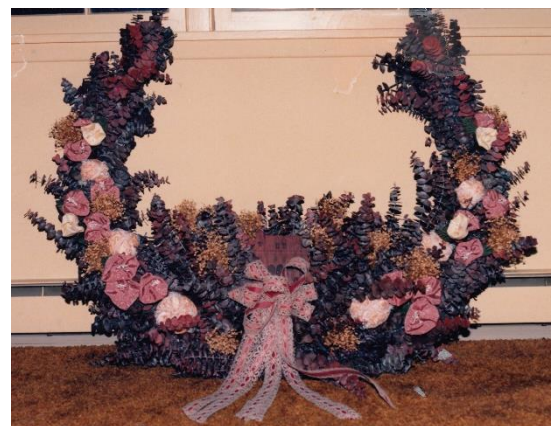
"Memories in Silk," Festival of Trees & Traditions, 1985.