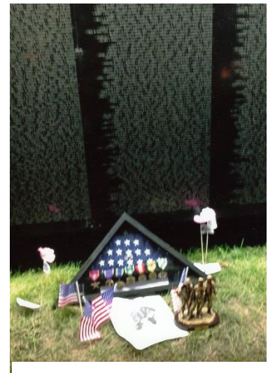
Memorials at the Wall that Heals

2016 – In cooperation with the Hockanum River Linear Park, began a Foster Tree program where club members grow native trees for replanting in the park after invasive weeds, especially Japanese Knotweed, are removed.