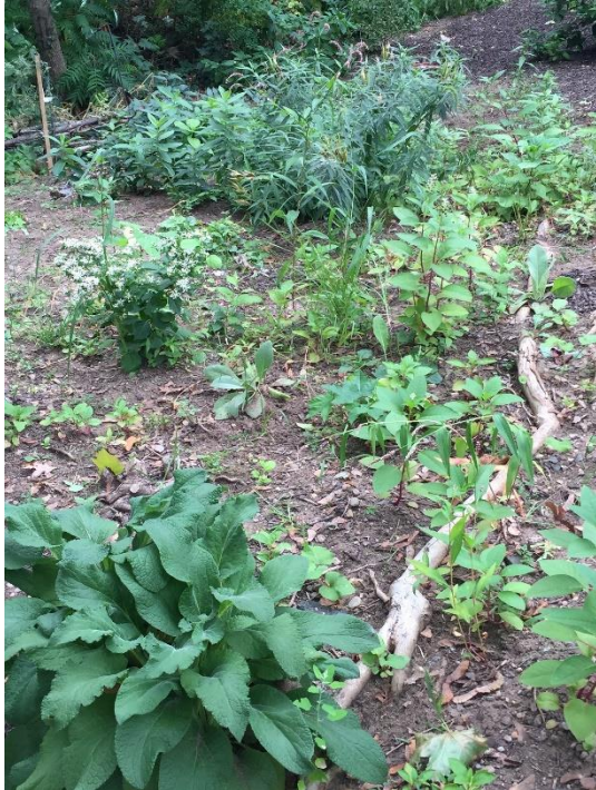
Plants filling in after a season of growing

Created a Monarch Waystation in Center Springs Park, by clearing an area at the edge of the park and planting it with butterfly friendly plants such as milkweed.