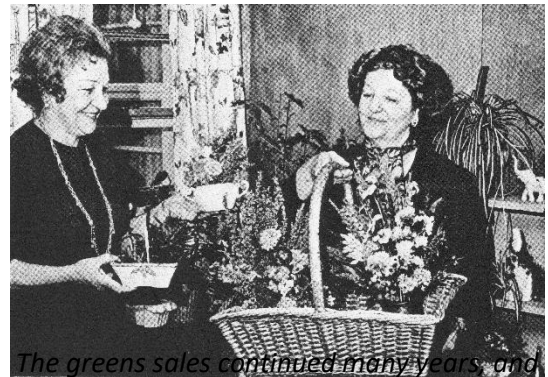
The greens sales continued many years, and included demonstrations, speakers, and a boutique of arrangements for sale.

Participated, with the Chamber of Commerce, in establishing the Memorial Tree Program.