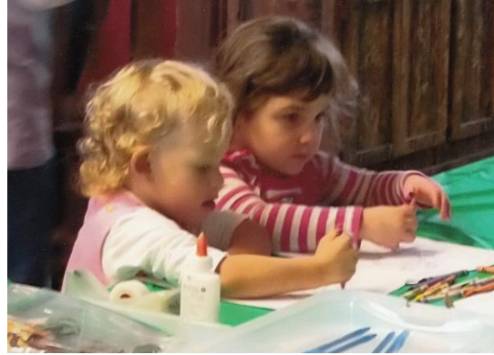
Children creating ornaments at the Lutz Children’s Museum.

Engaging Children in Gardening: Began a children’s program in cooperation with the Lutz Children’s Museum. In November 2015, the club held a workshop where children made holiday decorations. The children then joined the club at the Cheney Homestead in December to view the tree adorned with their creations. Future programs are planned on Oak trees and other aspects of gardening.